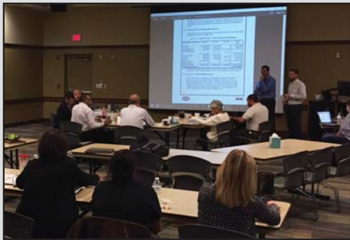
City Council members and staff review a report presented at Taylor Public Library at the end of 2017 about the Strategic Combined Facilities Master Plan, presented by Sledge Engineering.

A new year is filled with fresh opportunities and time to complete what was started the previous year. For the Taylor City Council, review of the Strategic Combined Facilities Master Plan at the end of 2017 showed them the needs and potential costs of city projects across all departments: water, wastewater, the treatment plant, drainage system, streets, sidewalks, the municipal airport, parks and city facilities.